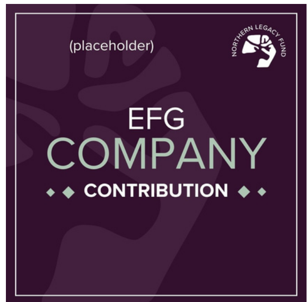
Example of a Named Contribution tile on our website.